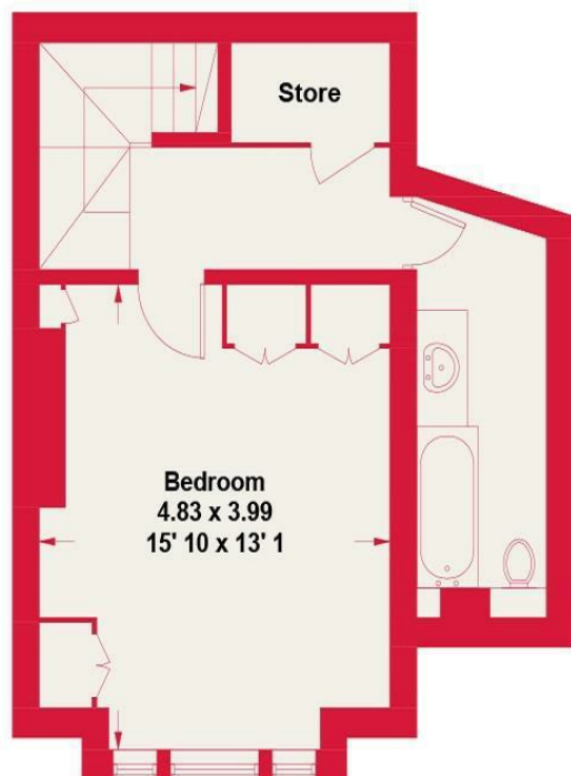
Lower Ground Floor 393 sq ft / 36.5 sq m